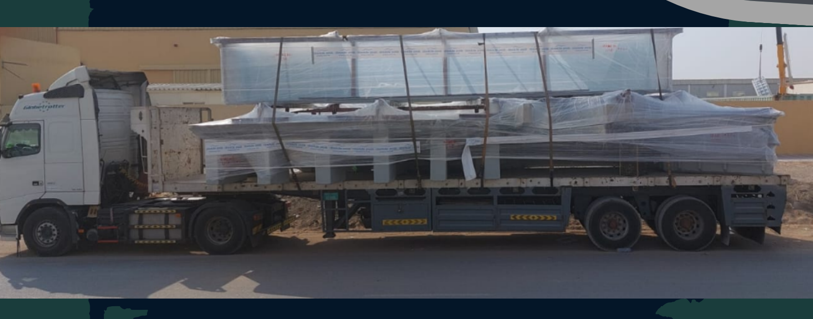
Project 3: Jumeriah Royal Atlantis Pools Project, Ummal-ul-Queen to Palm Jumeriah